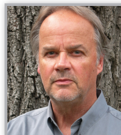
PAUL MACFARLAND ART PRESERVATION RESOURCES